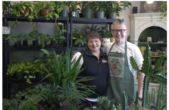
Potter's Green & Gift, Dover, NH Client since 2025

With NH SBDC, you get a trusted advisor— and a whole team behind the scenes.