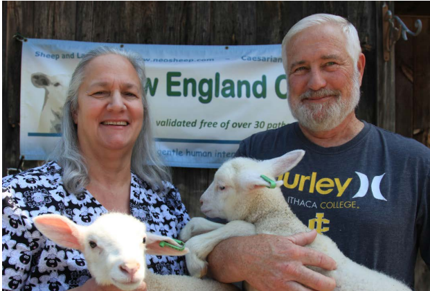
New England Ovis, Rollinsford, NH Client since 2024

The NH SBDC offers one-on-one support and practical resources for every stage of business—at no cost to you.